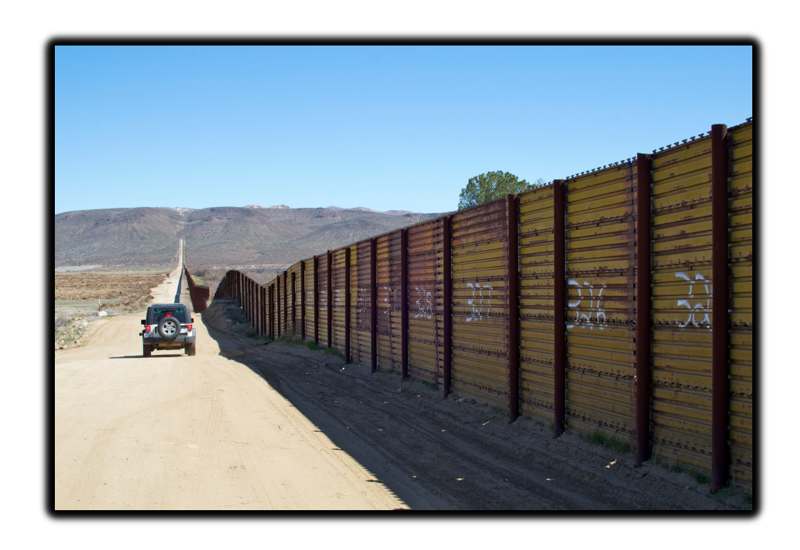
Figure 3: The U.S.-Mexico border in rural California. As of 2013, the Secure Fence Act has installed one layer of fencing across a 650-mile expanse.

Figure 2: Border fences at Tijuana's Playas Parque . The first reads 'Butterflies are free not me,' referencing the fact that butterflies may move freely between the two beaches, whereas people cannot. The second shows the fence extending into the Pacific Ocean. The third reads 'Guardian ... aqui empezo. 18 anos despues, 5,800 muertes logro [Guarding began here. 18 years later, 5,800 deaths accomplished.]', a reference to this fence's resurrection – as a result of 1996's Operation Gatekeeper – and the number of deaths that have resulted from persons crossing through the desert, mountains and other dangerous, uninhabited areas instead.