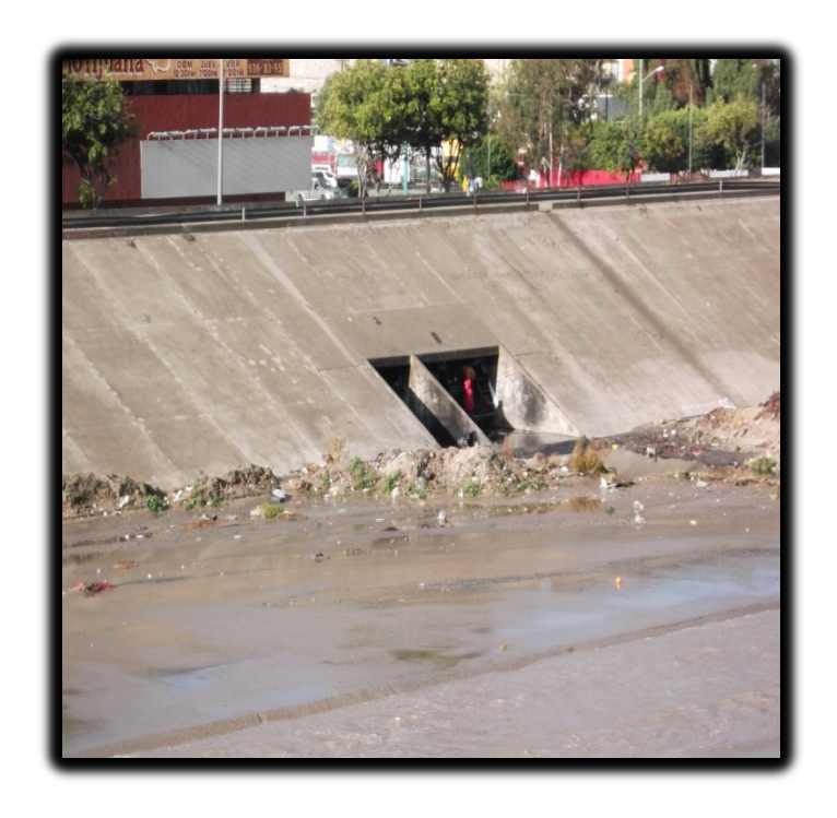
Figure 6. Young people hide in plain sight in a culvert on the Tijuana River while awaiting dark and an opportunity to cross the border (Photograph by Stuart Aitken).