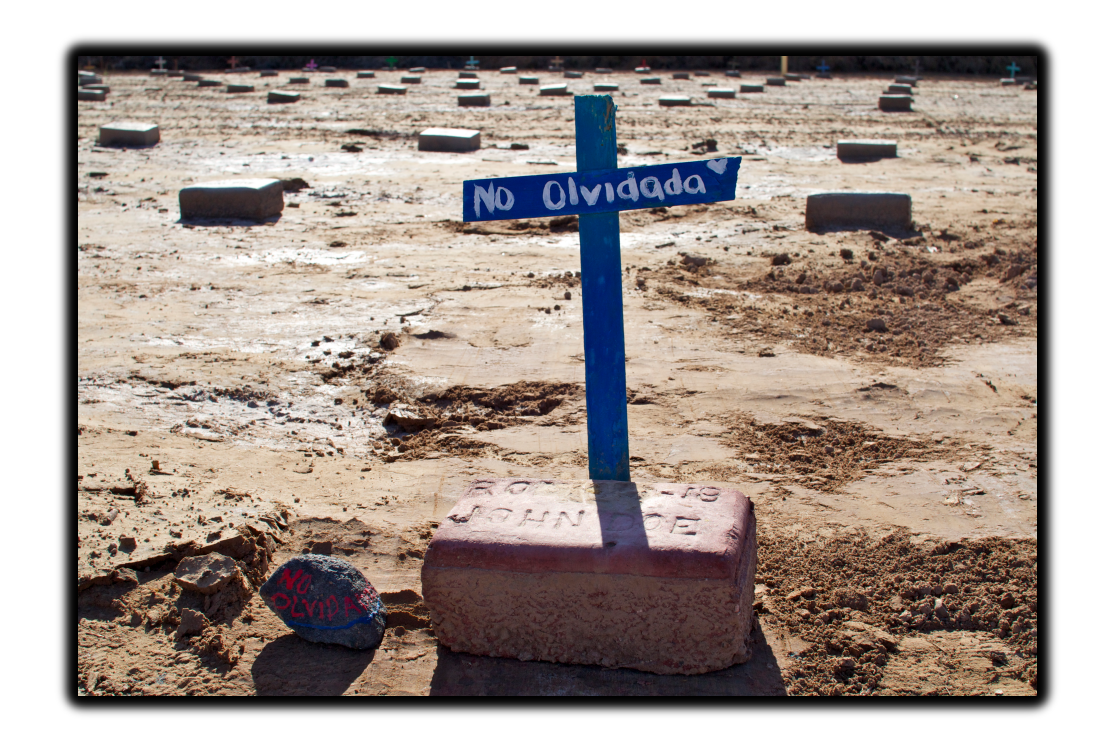
Figure 4: Holtville Cemetery, California. Some of the gravesites are marked with memorial rocks and stones which state, 'No olvidada' or 'Not forgotten'.

The contexts of violence and death in and around the Mexico-US border notwithstanding, constructing a clear understanding of the movement of young people across this border without recognition of larger global inequities as a context of state violence would be difficult.