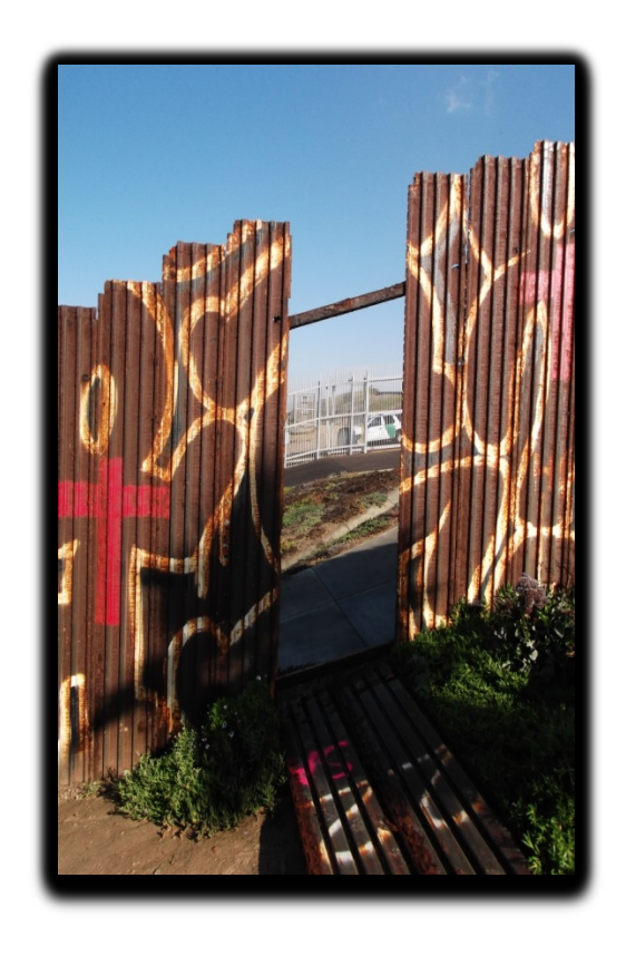
Figure 5. A deterritorialization of the border fence in Tijuana, thwarted by two more fences before the U.S. is reached.

Borderlands, as striations and smoothings, collide and collect, moving and transforming the movements of unaccompanied minors. As invisible as they are, their endless repetition as unaccompanied/independent/autonomous produces a camouflage behind which the young people work within the existing order to ensure their own survival and sometimes that of their families and communities (Figure 6).