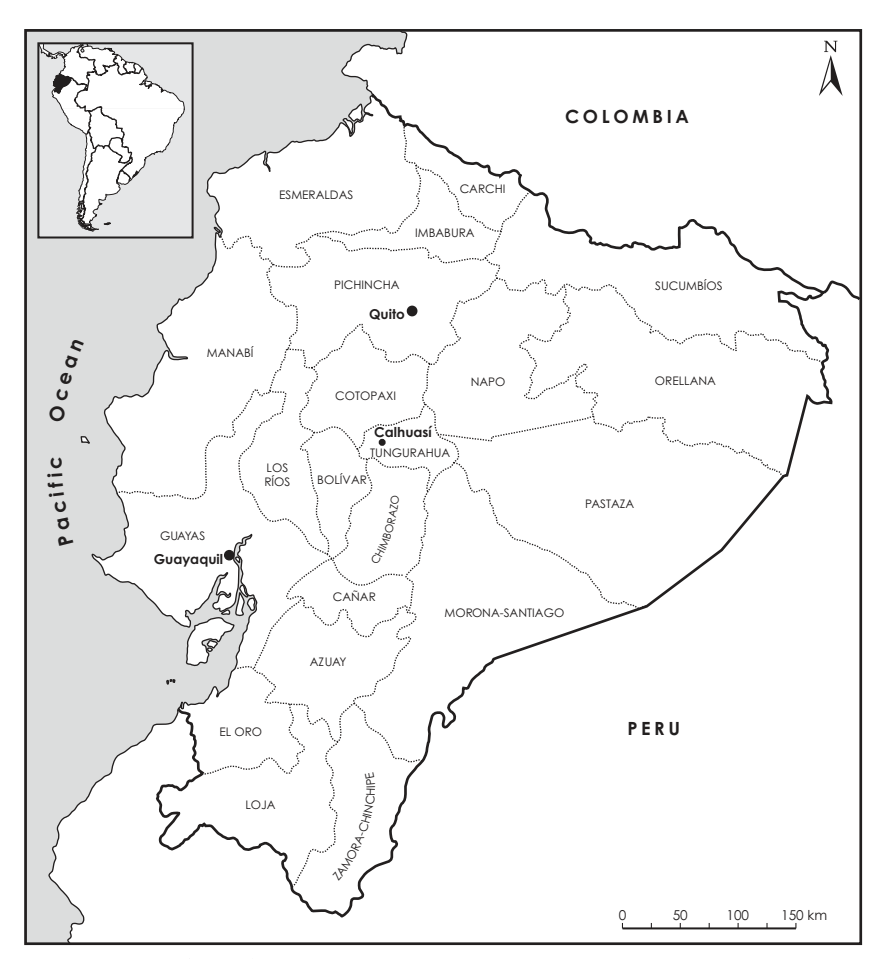
FIGURE 2. Map of Ecuador.

The construction of Calhuasi's first road in 1992 may have been the key catalyst for recent social-spatial change. The new road provided not only an economic link to labor and commodity markets but also a way out for the community's young women and children, who formerly had been isolated at 11,150 feet (3,400 meters). Actively pulling themselves into the modernization process, young indigenous women and children have since been challenging their assigned positions in Ecuador's social and racial hierarchies. They are rejecting employment as domestic workers, striving for better education, and using their earnings to participate in consumer culture. To improve their economic positions they have shifted from agricultural work to informal street work. Rather