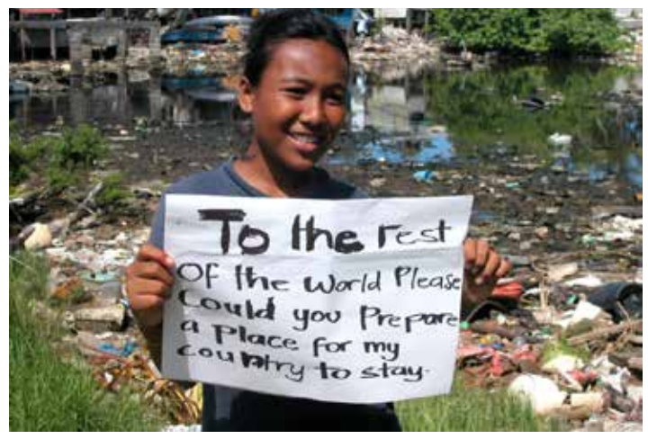
Figure 2: A global plea from a resident on the island nation of Tuvulu

Pacific, is a case in point. Currently, Tuvalu is at great risk from rising sea levels caused by melting Arctic ice. Due to carbon emissions from China, Canada, the United States and other fossil fuel intensive countries, the nation of Tuvulu is sinking into the Pacific Ocean. Students must learn how local actions can have profound global consequences (Figure 2).